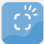
Image-supported | Eye gaze/touch/scanning | Windows/iPadOS compatible

An evidence-based program focused on basic reading skills for people with communication disabilities.