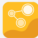
Image-supported | Touch/scanning | Windows/iPadOS compatible | Designed for tablets

An instant scene-based language learning app that turns everyday moments into learning opportunities.